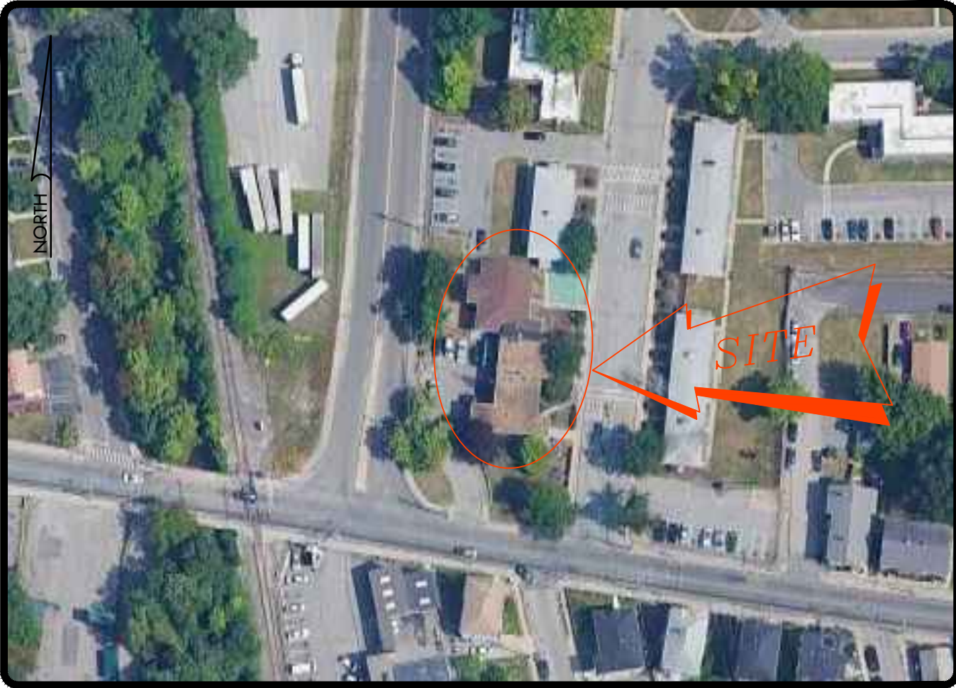
MAP: LOCATION MAP SCALE: 1" = 100'